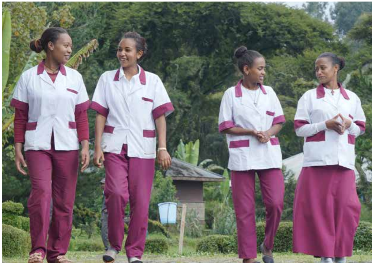
Midwifery students at the Hamlin College of Midwives' campus in Addis Ababa (above)

Hamlin Midwives save the lives of thousands of mothers and babies every year and prevent countless fistulas. They are the key to eradicating obstetric fistula in Ethiopia.